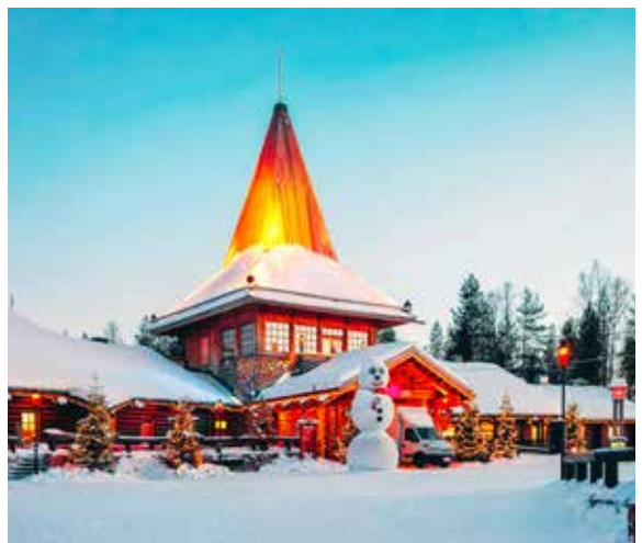
Santa Claus Village