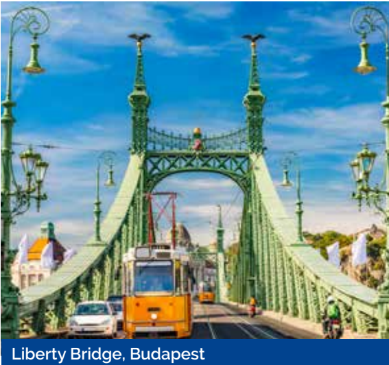
Liberty Bridge, Budapest