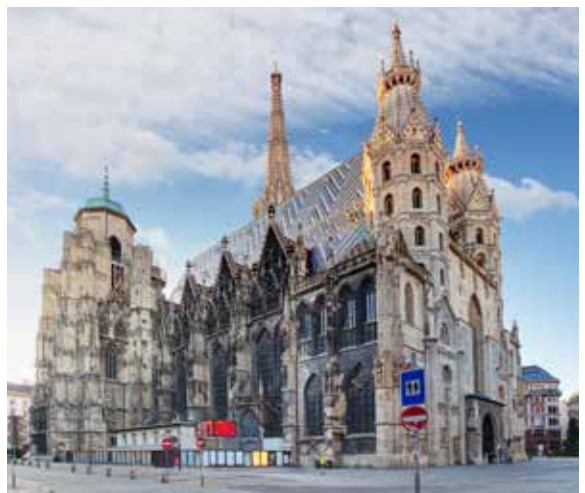
St Stephen Cathedral, Vienna