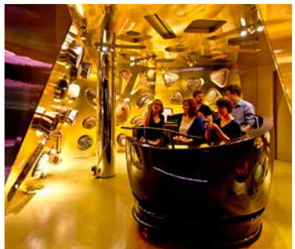
Swiss Chocolate Adventure