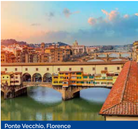
Ponte Vecchio, Florence