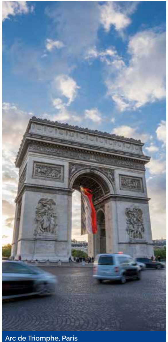
Arc de Triomphe, Paris