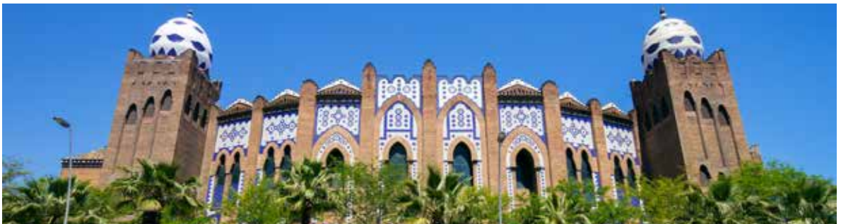
Bull Ring, Barcelona