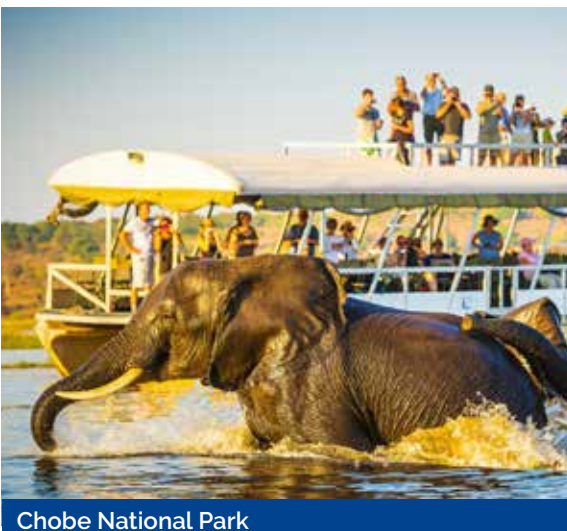
Chobe National Park

Early morning depart to Johannesburg Airport and fly over to Livingstone. Visit the Victoria Fall, the largest curtain of falling water on earth measuring 1708 meters wide and with an average depth of 92 metres. Conditions are right, the spray plume is 500metre high and can be seen from as far as 70 kilometres away. In full flood, over 550 million litres of water per minute are cascading over the brink. Today will start with the Victoria Fall's first view point - Devil's Cataract and you will go along the route the different viewpoint also with different angle and height. Cross the border and arrive at Zimbabwe.