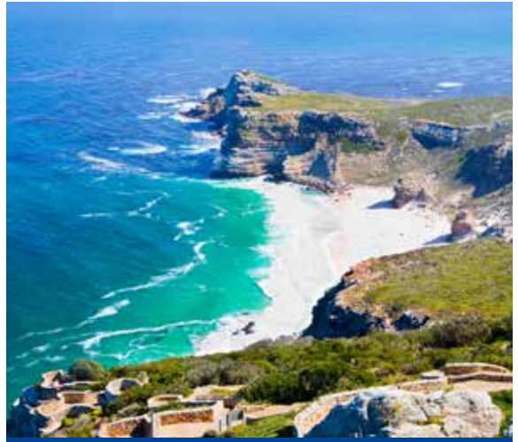
Cape of Good Hope

Buffet Breakfast at hotel restaurant. Sun, sea and sand rank high among the Cape Peninsula's drawcard. Along the route, you will pass over sea point, Clifton where some of famous Hollywood celebrities up market properties can be seen. As you arrive Hout Bay, the magnificent backdrop of Chapman's Peak will be in front of you. Take a cruise around the Sentinel Peak where you will see hundred thousand of seals on the little island. Along the way, arrive Fish hoek for your lobster lunch. After it, Boulders at the Simons Town, this is where you will see the African penguins on the seashore right next to you. Cape Point is the highlight of the Cape of Good Hope Nature Reserve. Nearly 8000 ha of indigenous fynbos cover the reserve. In spring, this natural garden bursts into bloom in a surge of colour. About 1200 plant species have been recorded in the area. Cape Point is the southwesternmost point and inspirational tip of Africa. For sheet majesty and excitement, no visit to the Peninsula would be complete without a trip to Cape Point. Reach the viewsite above Cape Point, take the Funicular Train to the top. Once you reach the base of the old lighthouse, you are rewarded with magnificent vistas, taking in the whole of False Bay and the distant Hottentots - Holland Mountains, Danger Point.