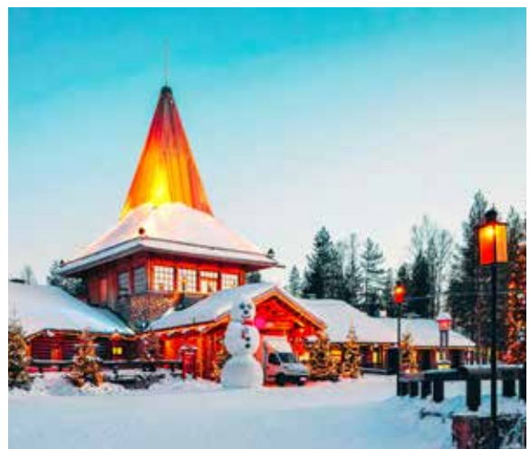
Santa Claus Village