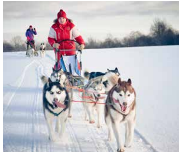
Husky Dog Farm