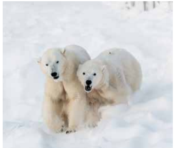
Ranua Wildlife Park