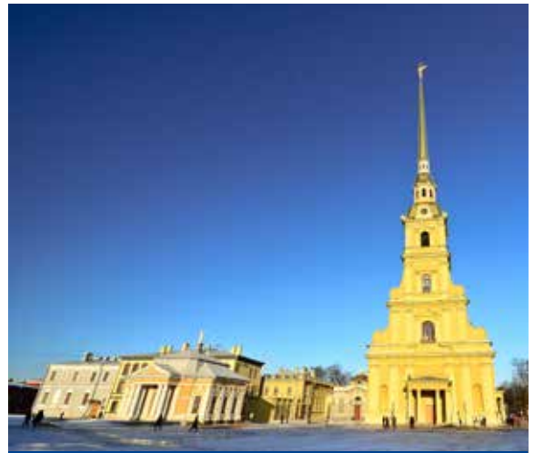
Peter and Paul Fortress