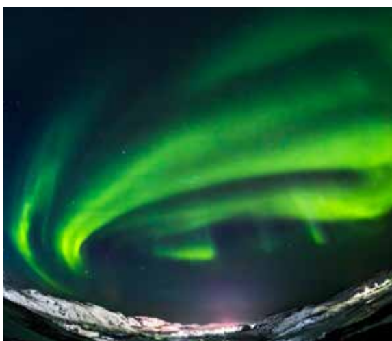
Aurora Borealis, Russia