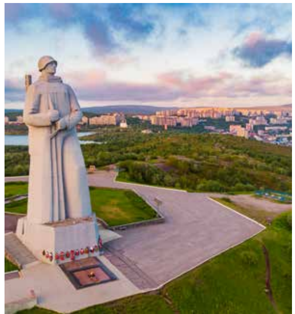
Alyosha Monument, Murmansk