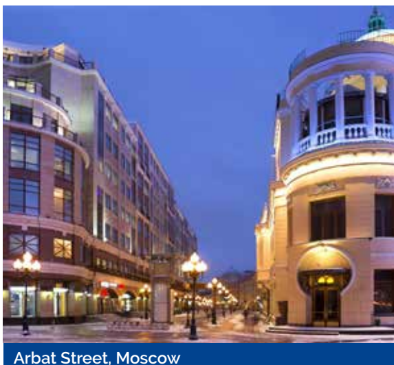
Arbat Street, Moscow