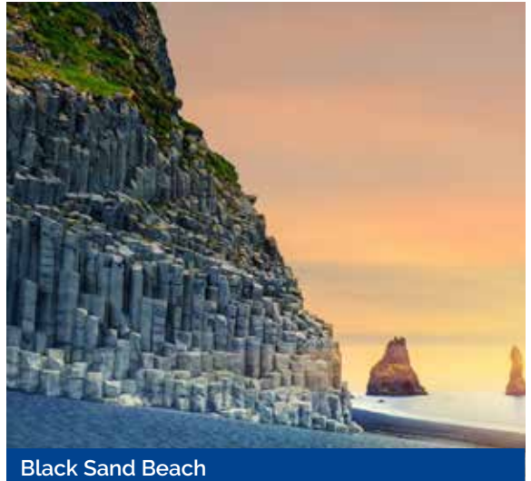
Black Sand Beach