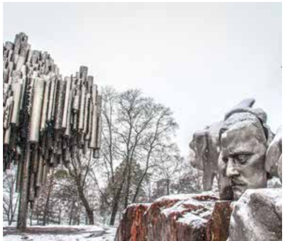
Sibelius Monument, Helsinki