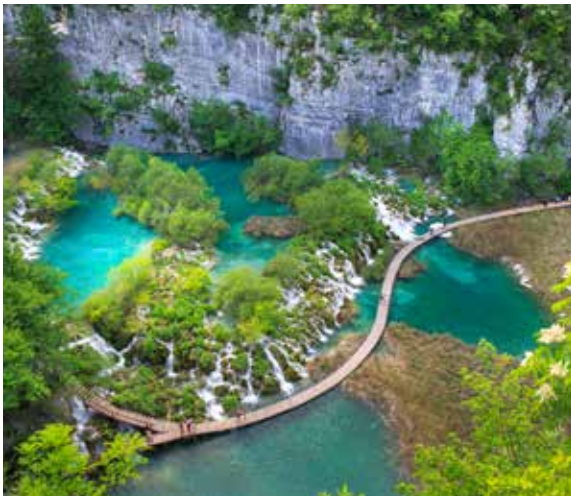
Plitvice Lakes National Park