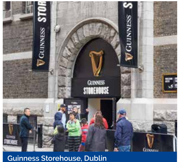
Guinness Storehouse, Dublin