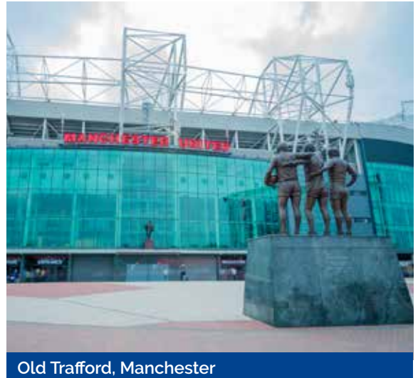
Old Trafford, Manchester