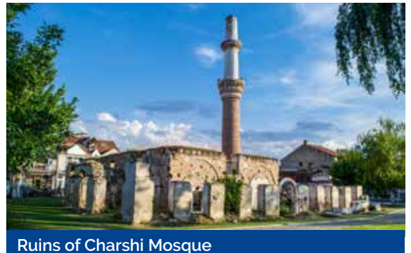
Ruins of Charshi Mosque