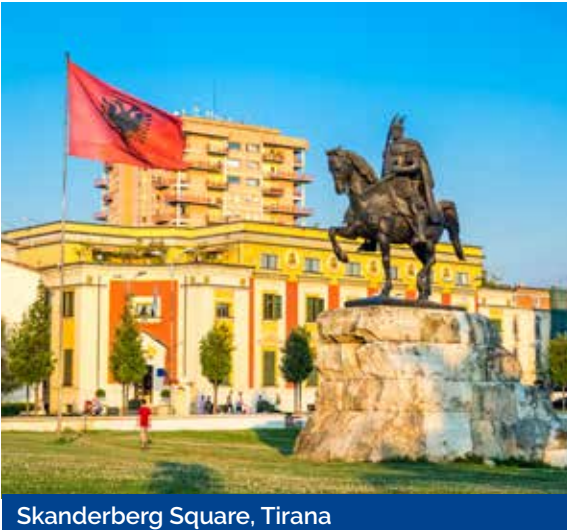
Skanderberg Square, Tirana