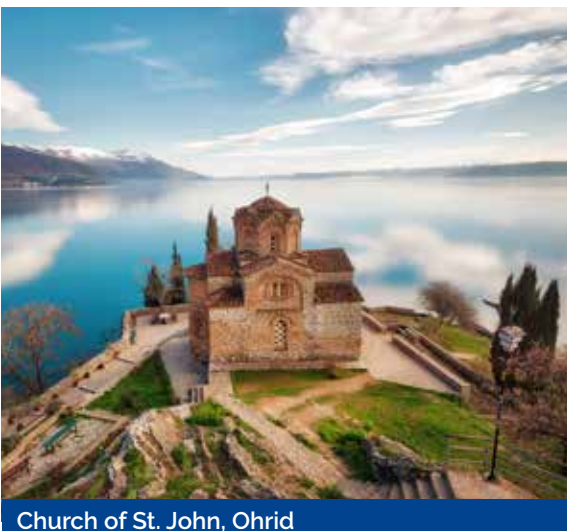
Church of St. John, Ohrid