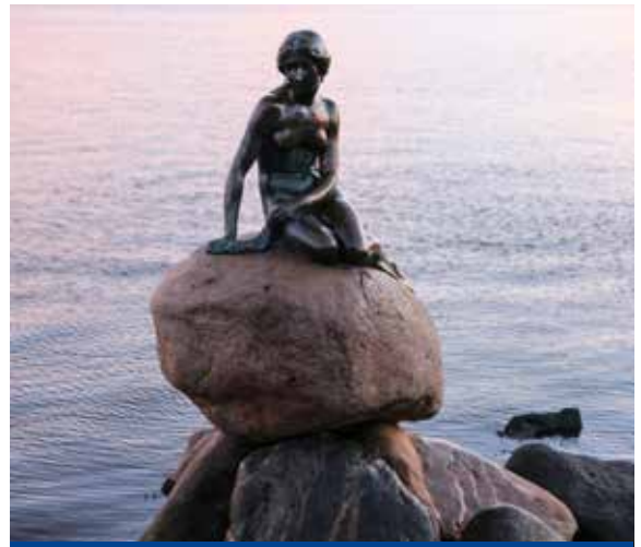
Little Mermaid, Copenhagen