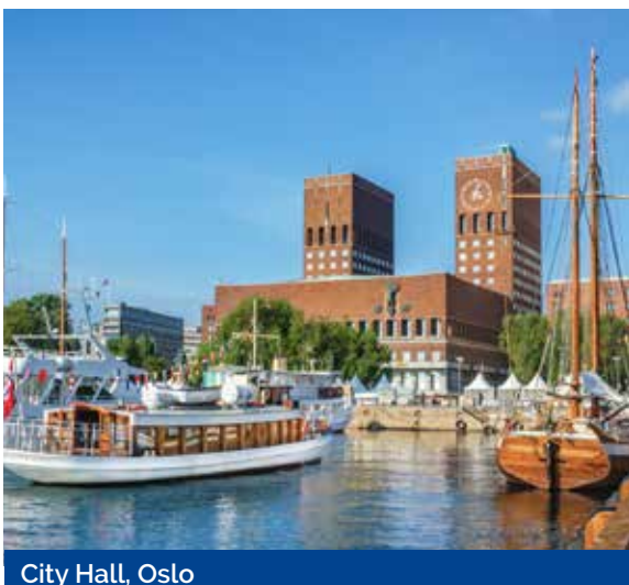
City Hall, Oslo