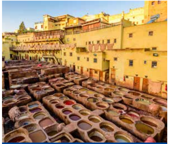
The Tanneries, Fes