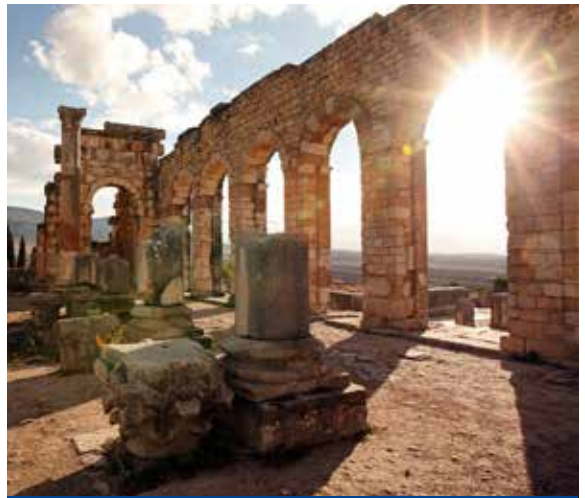
Roman Ruins of Volubilis, Meknes