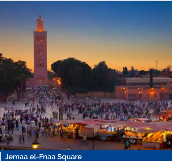
Jemaa el-Fnaa Square