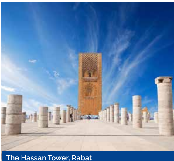
The Hassan Tower, Rabat