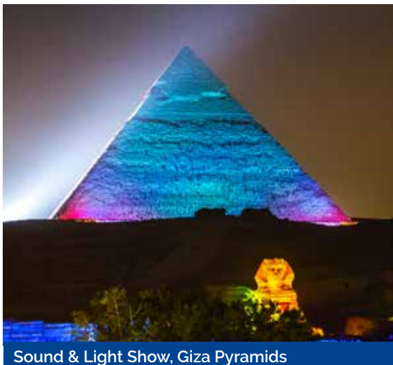
Sound & Light Show, Giza Pyramids