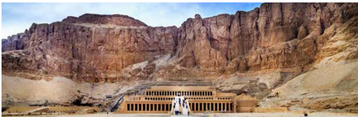
Queen Hatshepsut Temple