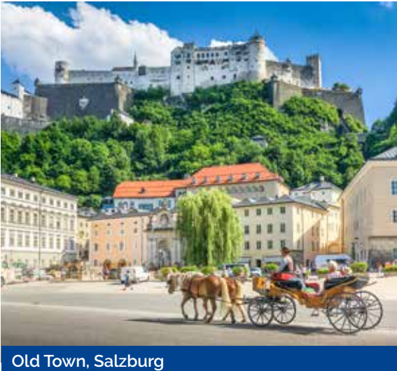
Old Town, Salzburg