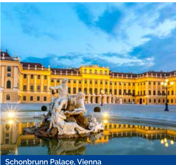
Schonbrunn Palace, Vienna