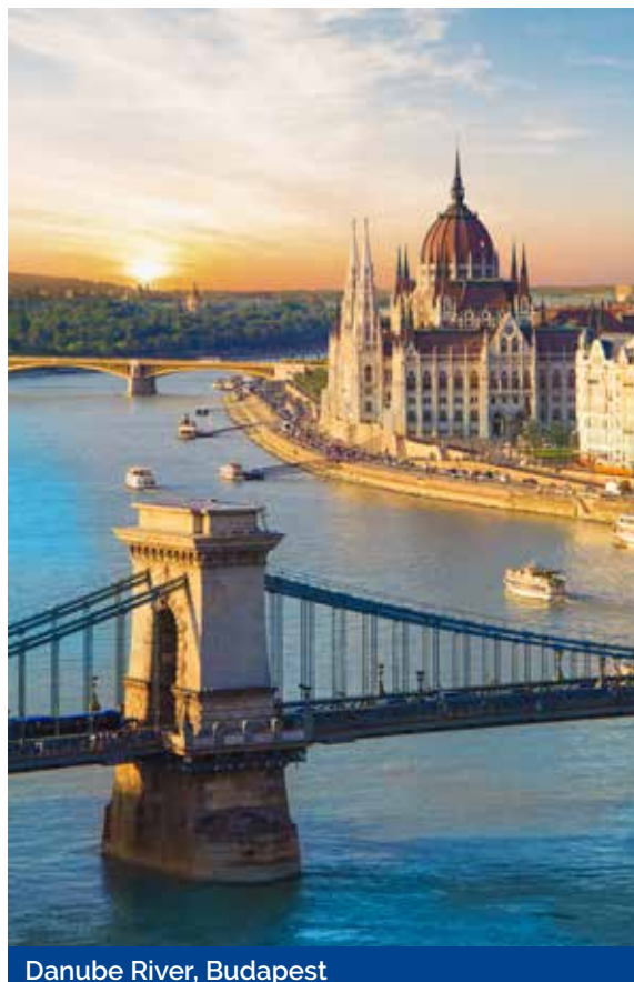
Danube River, Budapest