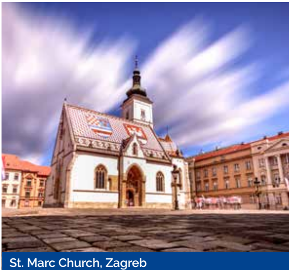
St. Marc Church, Zagreb