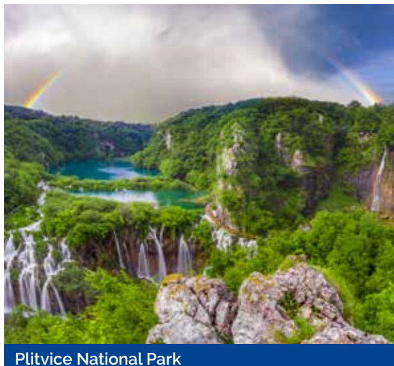
Plitvice National Park